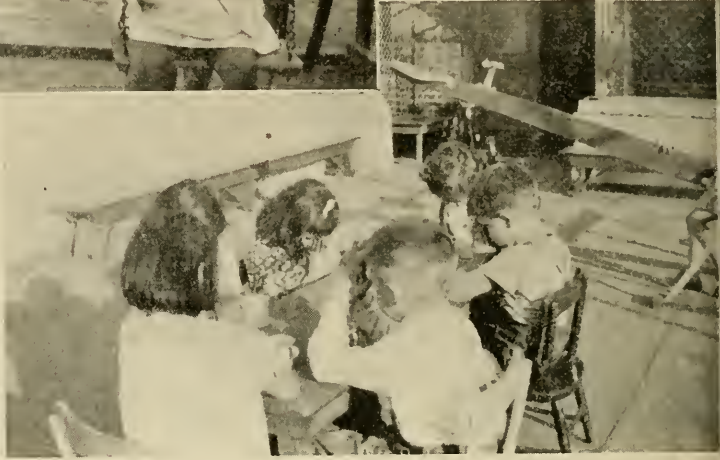
"Thank you, God, for good food and good times—and everything you give to us"